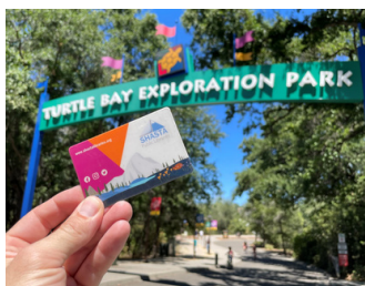
CREATING A NEW LIBRARY AWARENESS

The information gathered from the survey, focus groups, and patron usage data provided a view of what the community wants from the libraries assisting staff were able to create a new strategic plan focusing on these four areas: