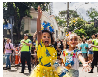
COMMUNITY HUB/ CULTURAL CONNECTOR