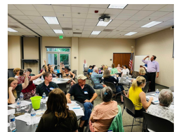
CENTER FOR LIFETIME LEARNING

These four areas, along with the objectives and goals set to accomplish growth, will help ensure the Libraries continue to develop and provide significant resources, tools, spaces, and materials for the community.